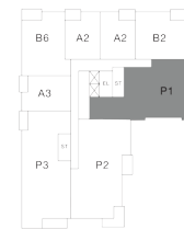
LEVELS 9 THROUGH 11