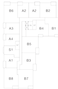
LEVELS 3 THROUGH 8