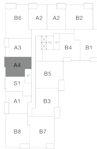
LEVELS 3 THROUGH 8