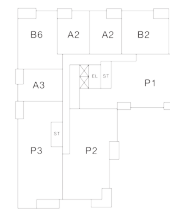
LEVELS 9 THROUGH 11