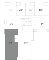
LEVELS 9 THROUGH 11