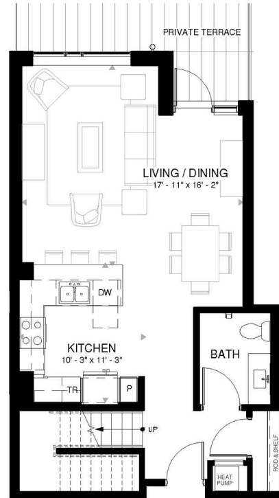
UNIT T2 LOWER